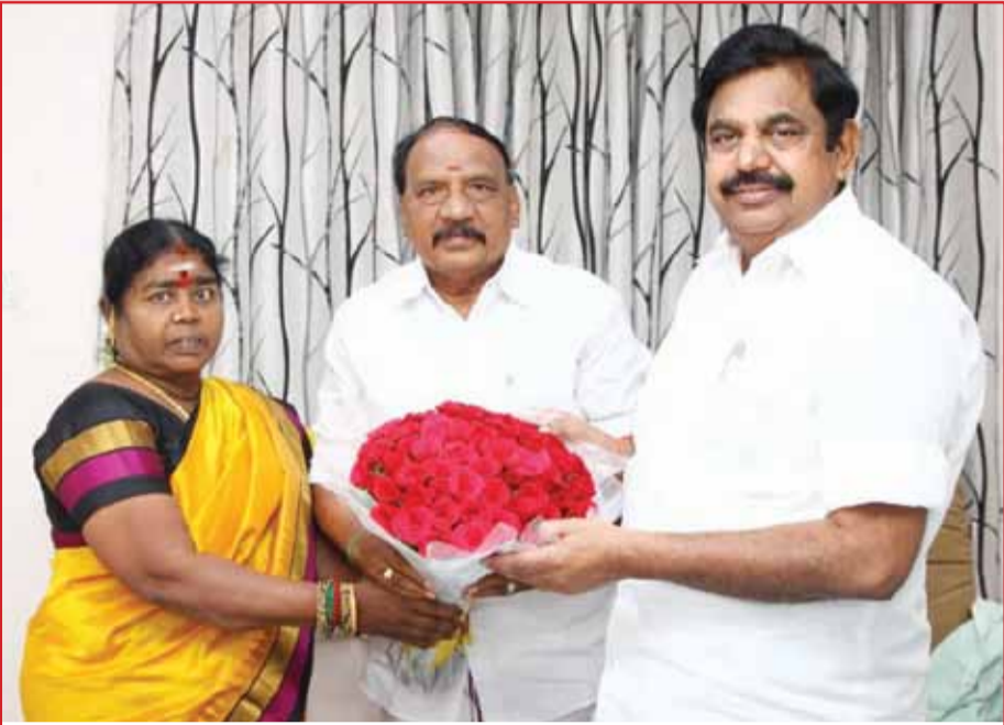
முதல்வர் எடப்பாடி பழனிசாமியை சென்னையில் அவரது இல்லத்தில், சக்கரபாணி எம்.எல்.ஏ., தனது பிறந்த நாளை முன்னிட்டு மனைவியுடன் சந்தித்து வாழ்த்து பெற்றார்.

சென்னை 8-10-2018 திங்கட்கிழமை [புரட்டாசி 22] வெளியூர் 9-10-2018 Volume - 9 Issue - 198 பக்கம் விலை Chennai Out Station Pages 6 Price ₹.3